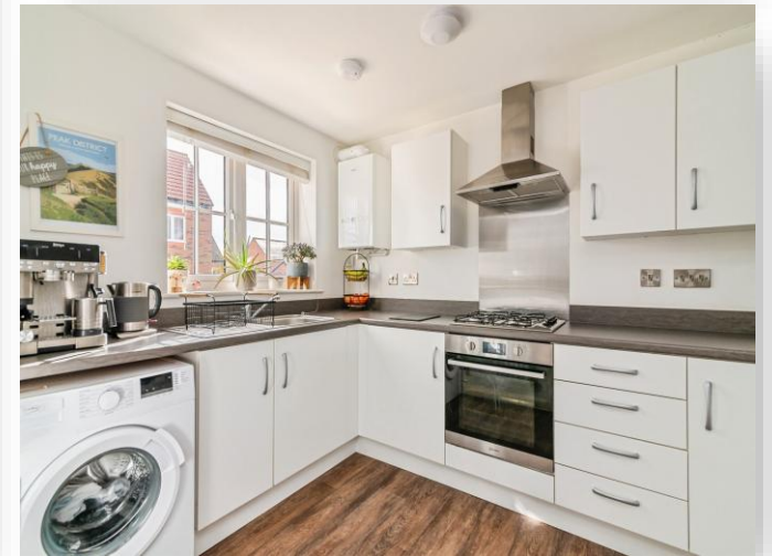
Aster Grove, Edwalton Nottingham NG12 4JB