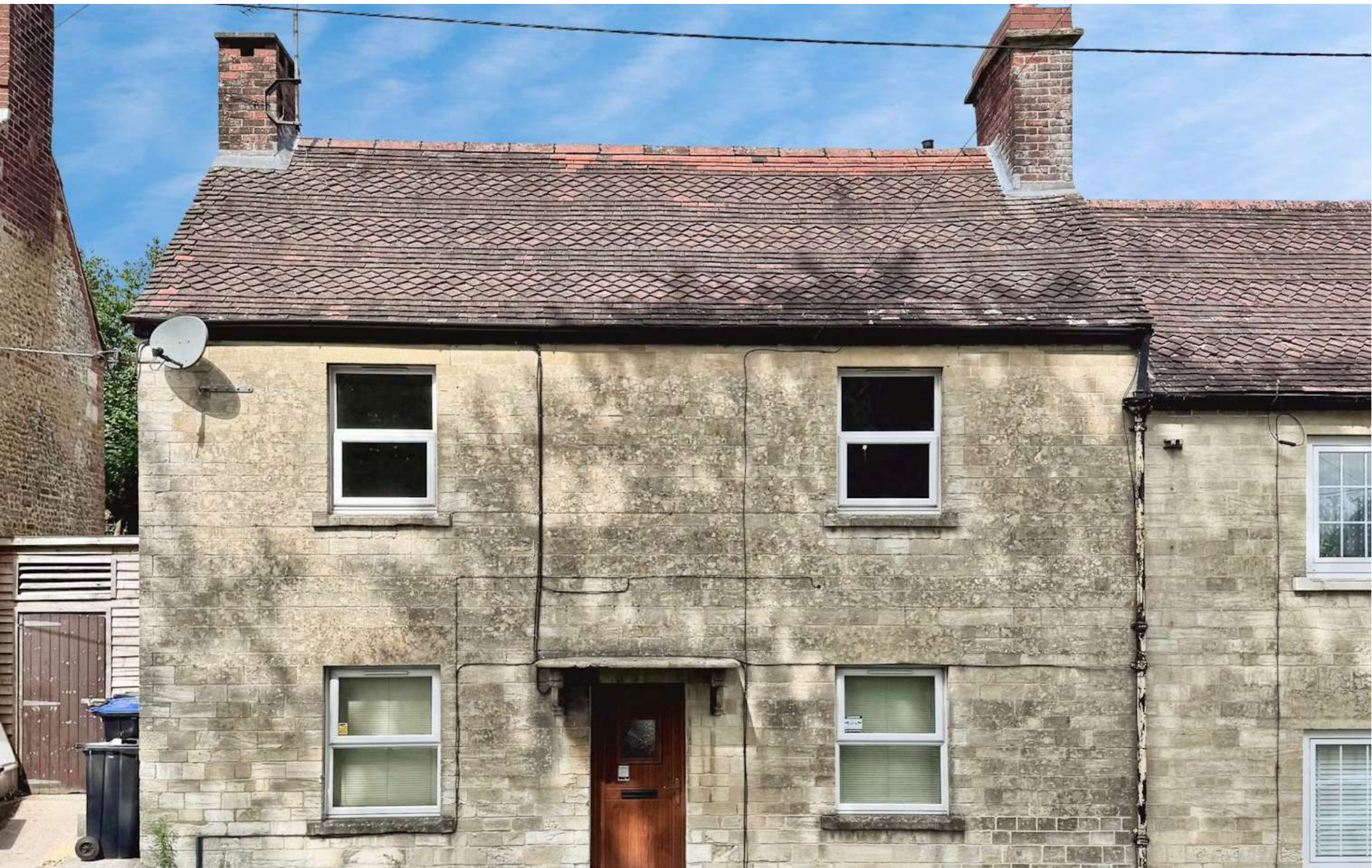
Pound Street , Warminster