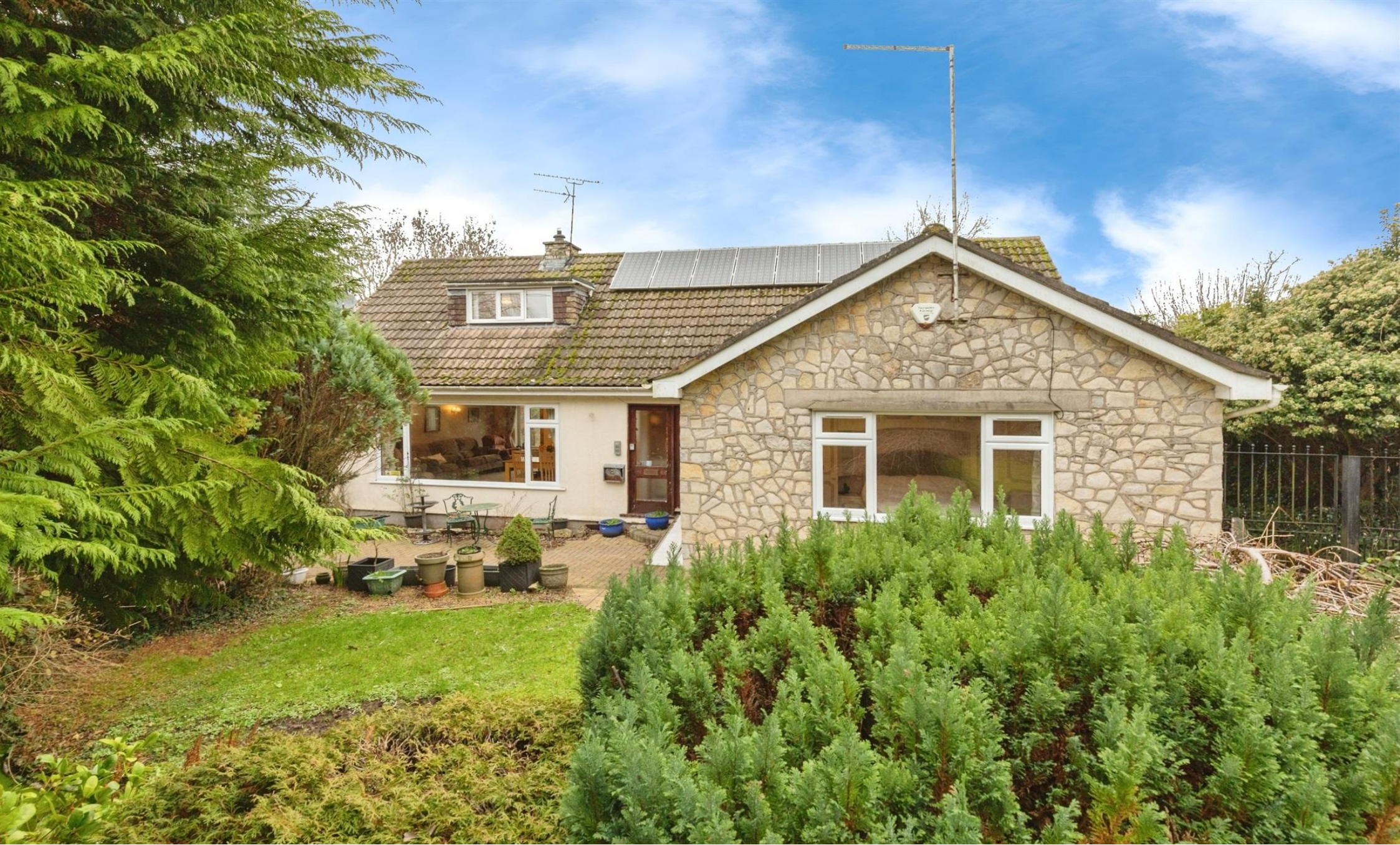
Carlingcott, Peasedown St. John Bath BA2 8AP