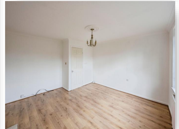
Highthorn Road, Kilnhurst Mexborough S64 5UP