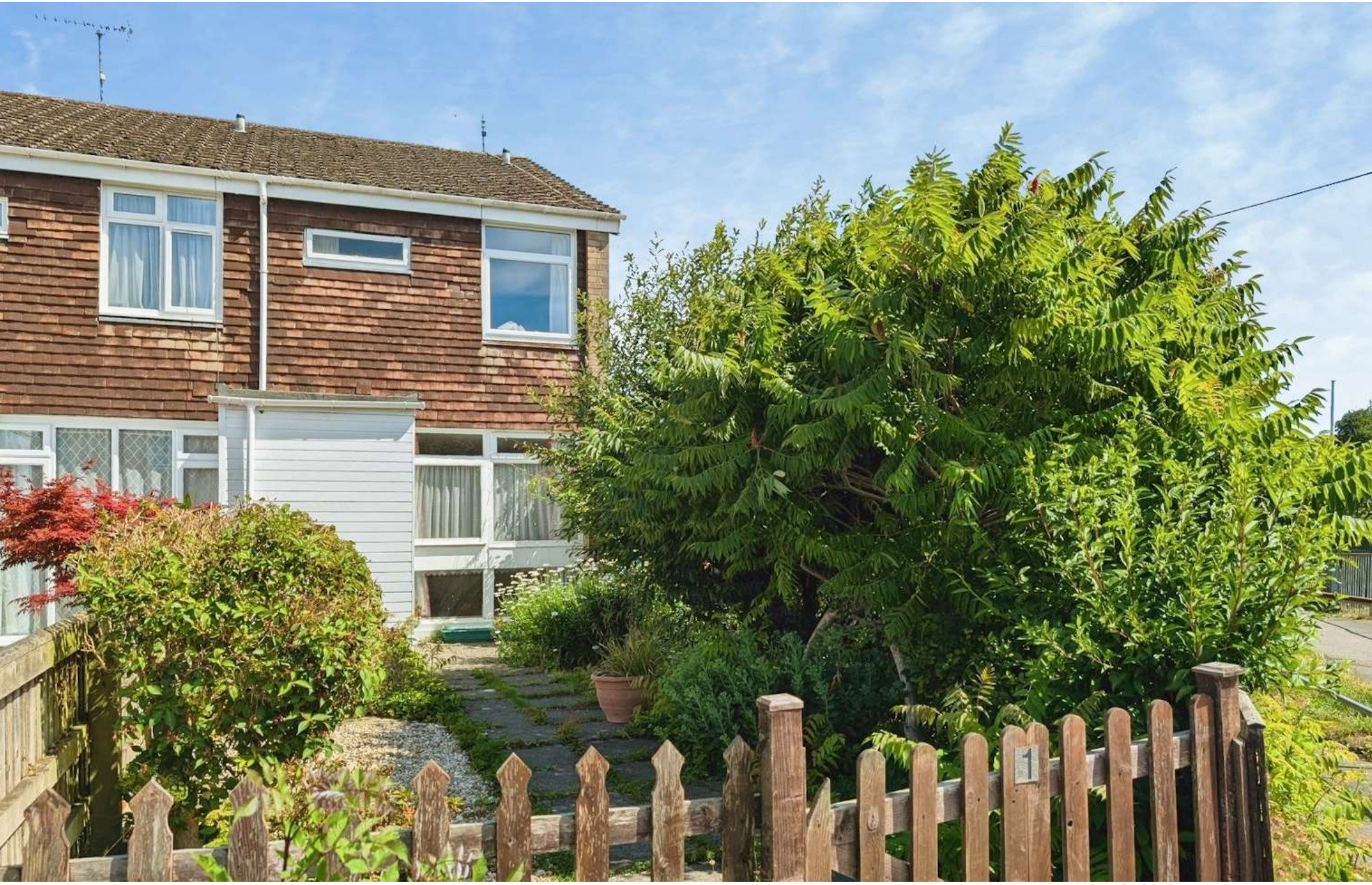
Foreminster Court Fore Street, Warminster