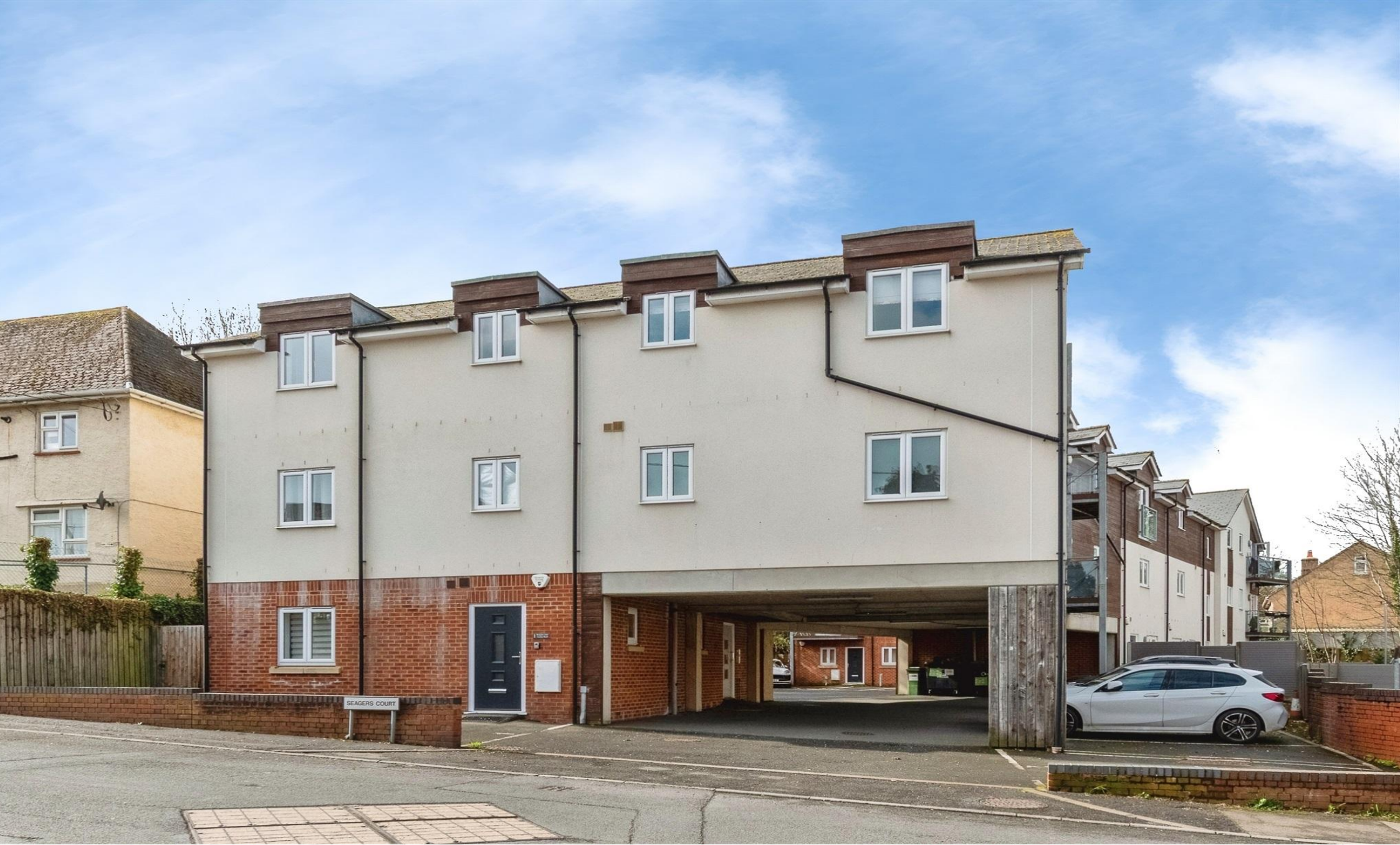
Seagers Court, Audley Road, Chippenham SN14 0EN