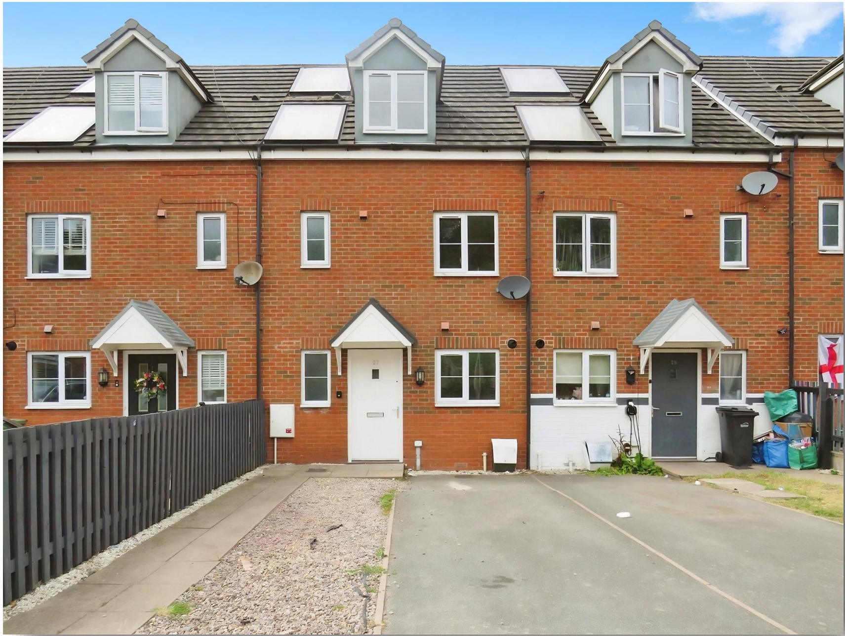
Washington Court Hillside Road, DudleyDY1 3AB