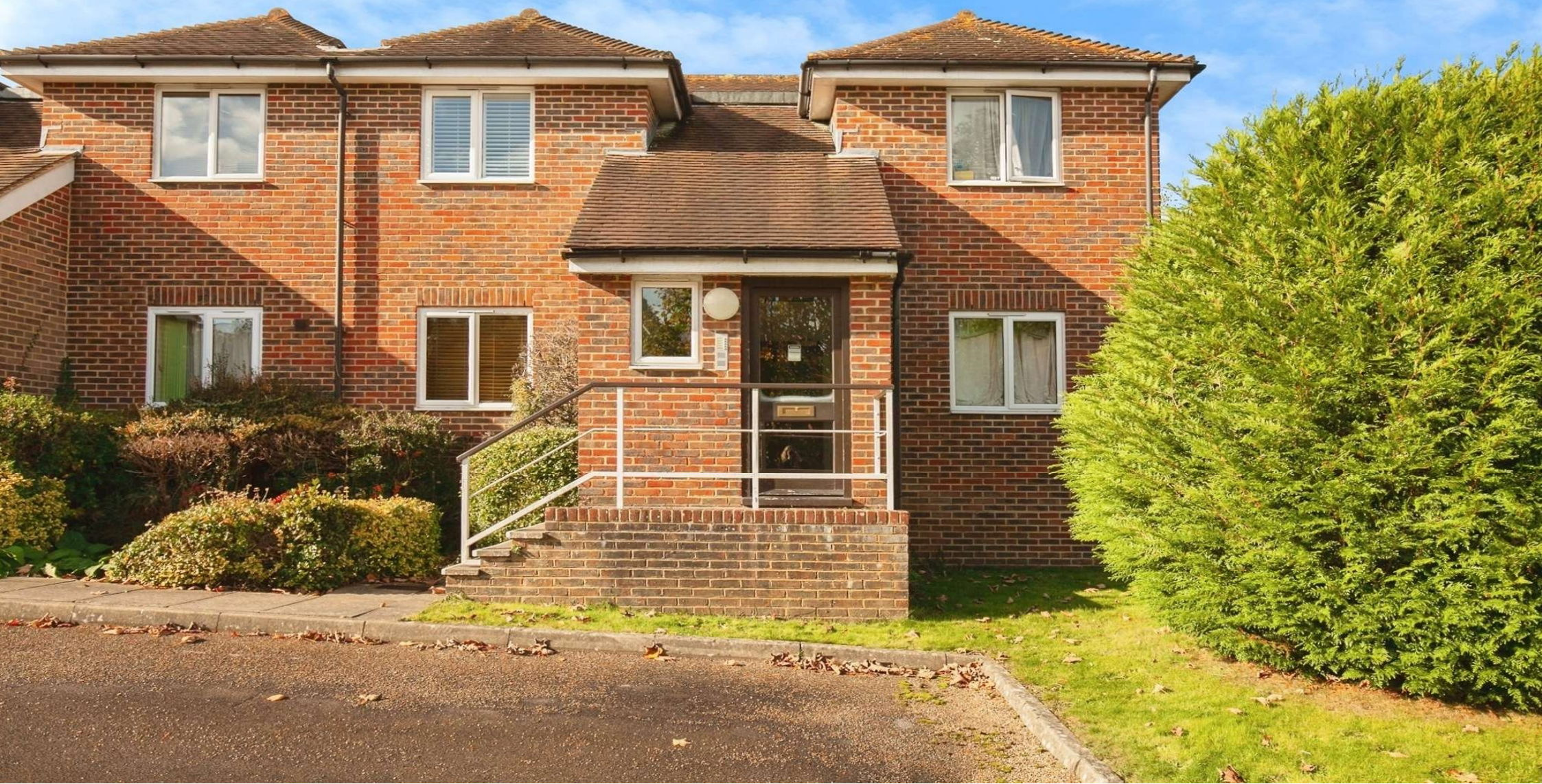
Gladeport, Heath Road, Haywards Heath RH16 3AE