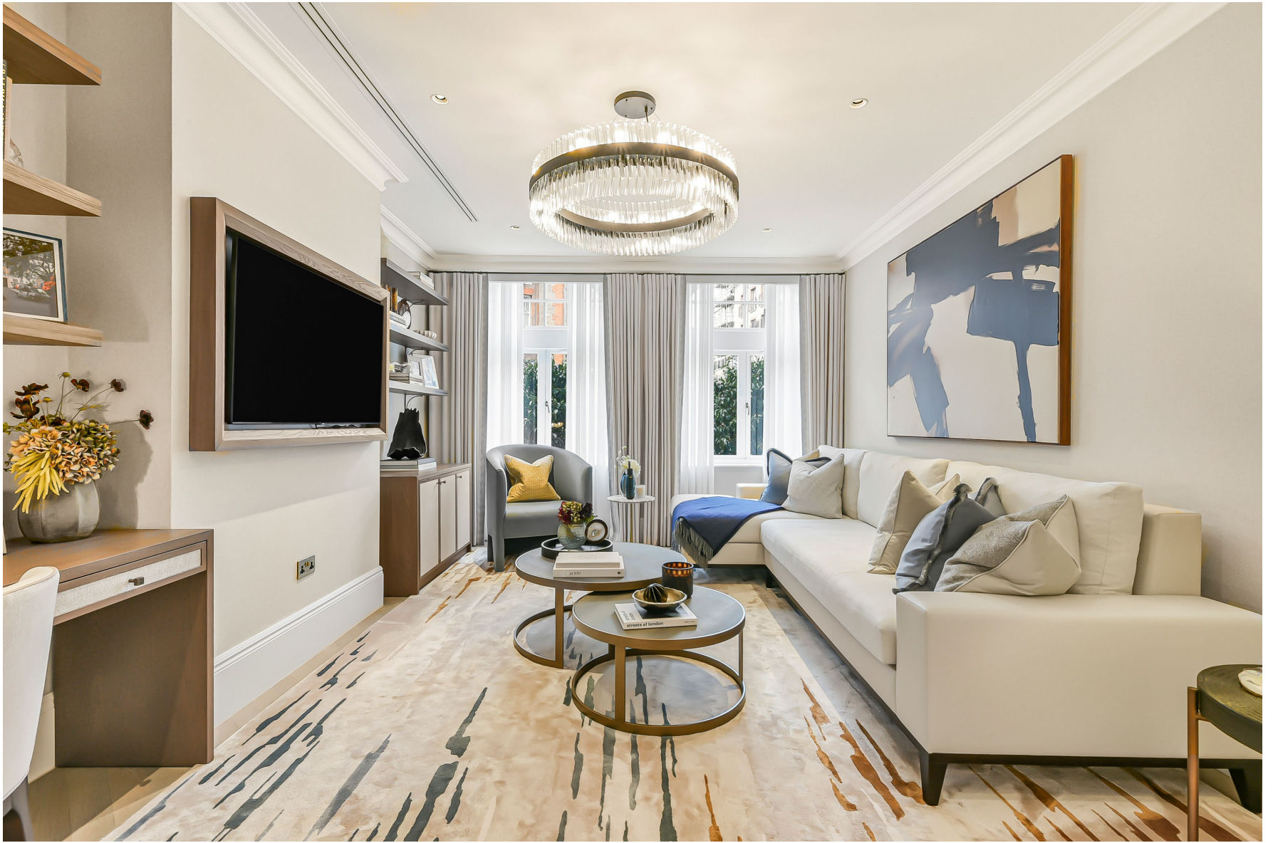
Apartment 001, Allen House 8 Allen Street, Kensington, London W8 6BH