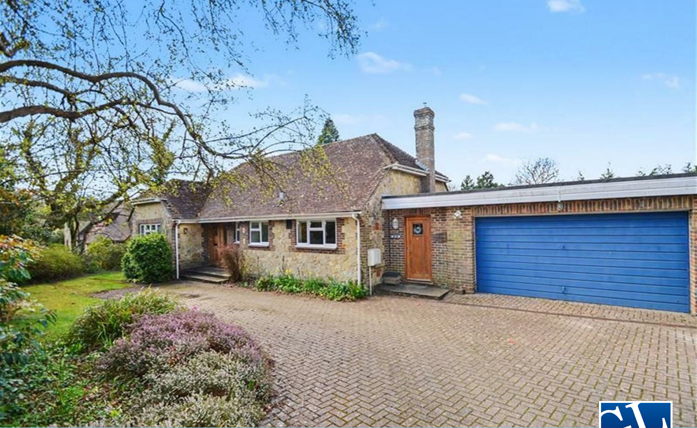
Roke Cottage, Melton Avenue, Storrington, West Sussex RH20 4BH