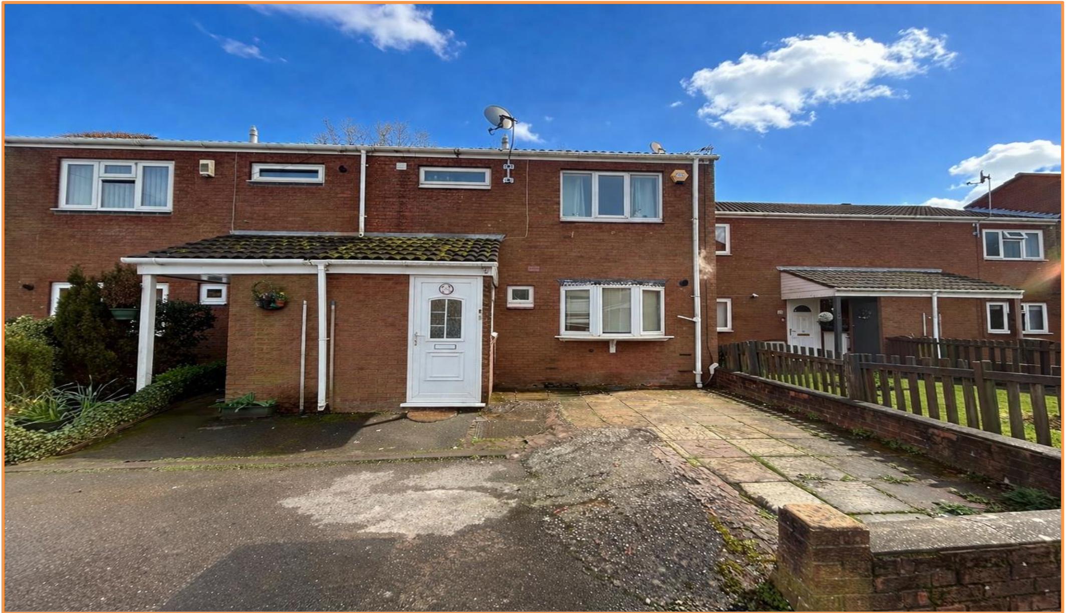
Arnold Close, Walsall, WS2 0LH