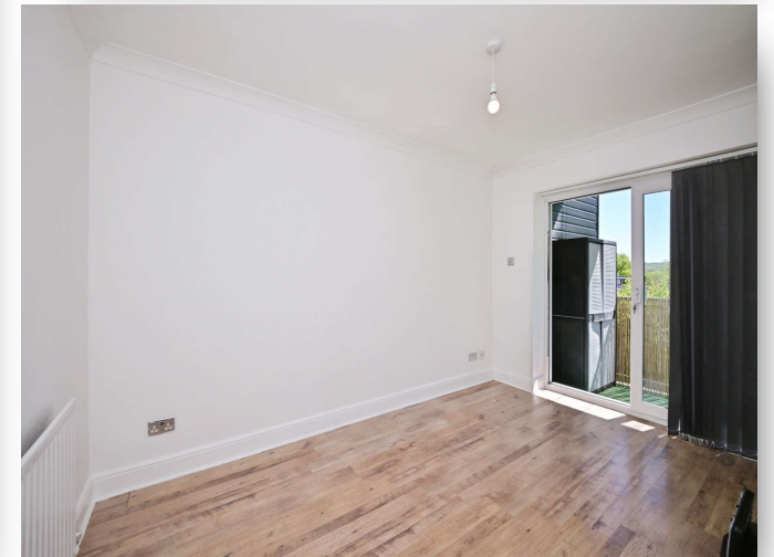
Shelley Court, Waltham Abbey EN9 3JG