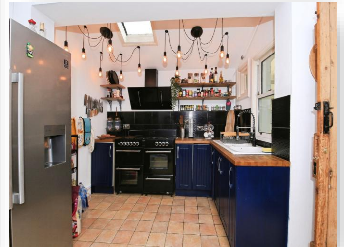
Broadway, Peterborough PE1 4DG