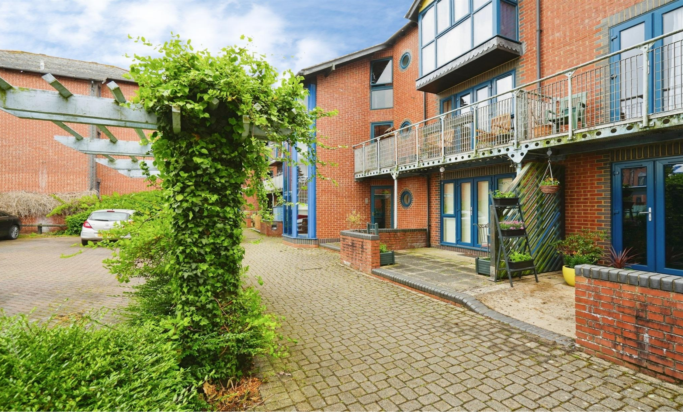
Alfredston Place, Wantage, OX12 8DL