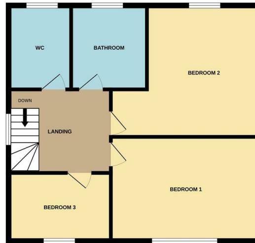
1ST FLOOR 659 sq.ft. (61.2 sq.m.) approx.