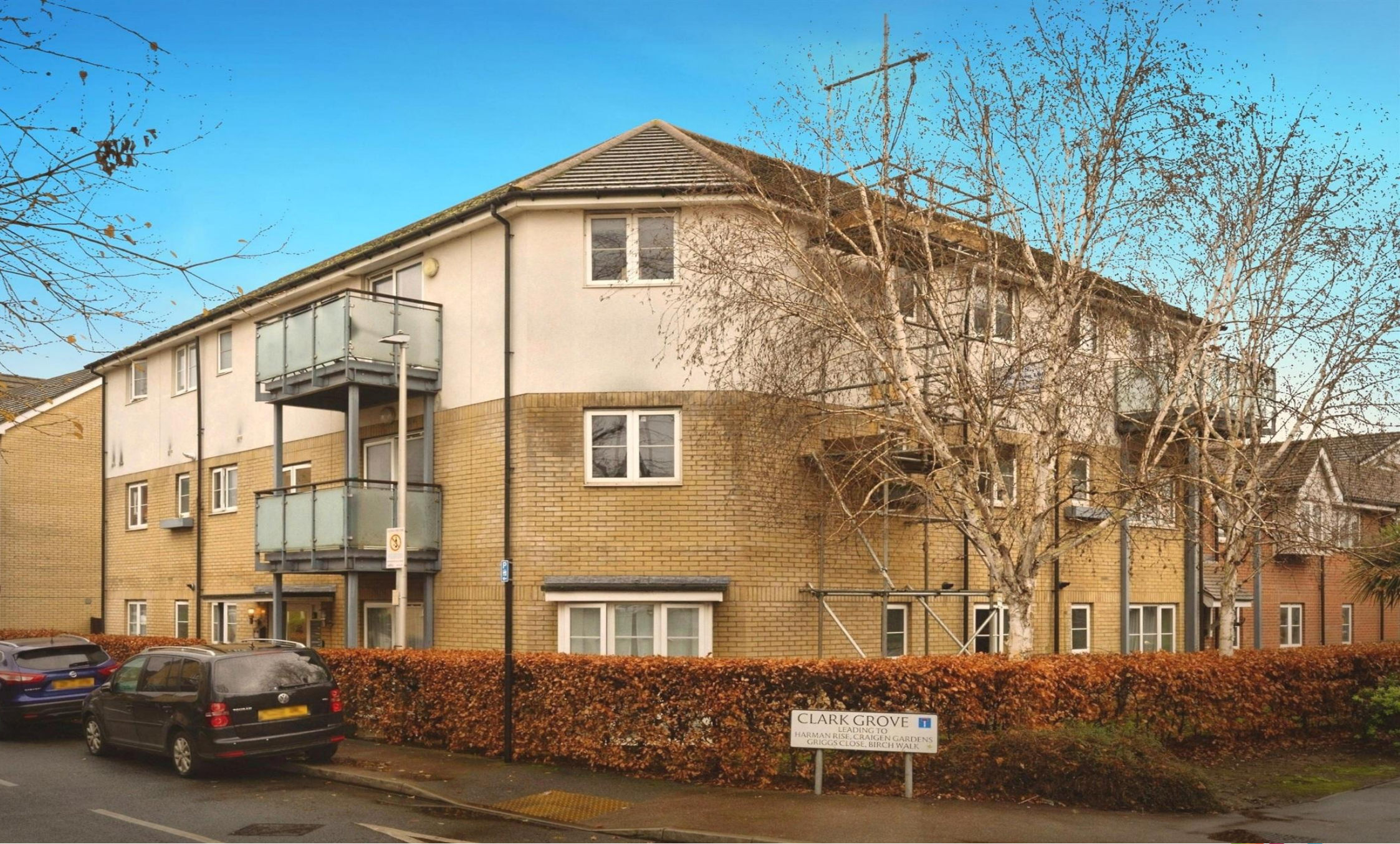
Clark Grove, Ilford, IG3 9FD