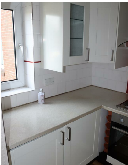
Modern Fitted Kitchen