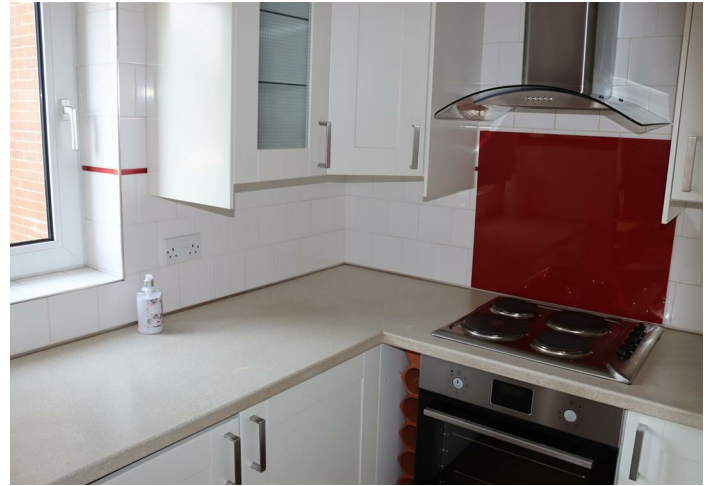
Modern Fitted Kitchen