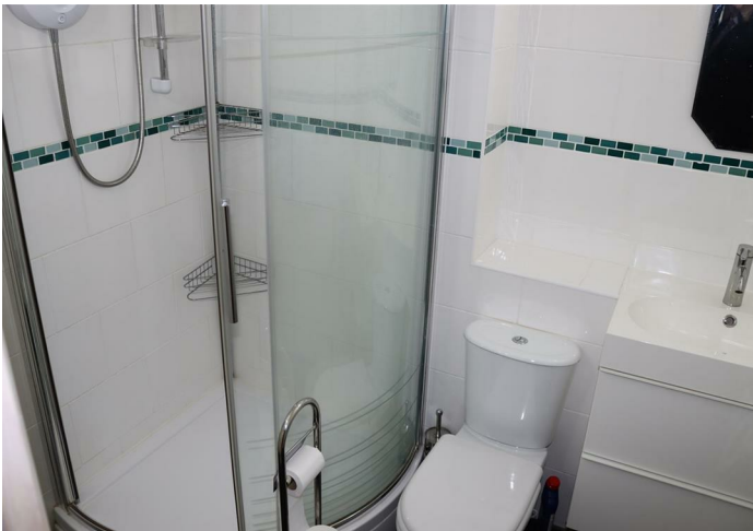
Modern Shower Room