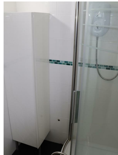
Modern Shower Room