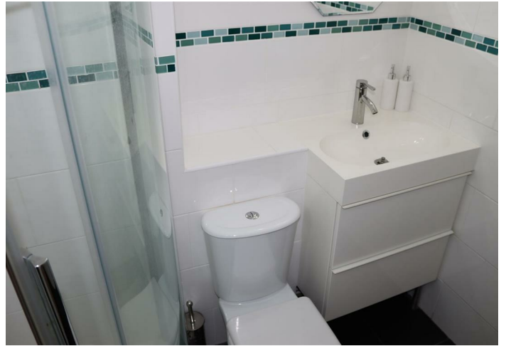
Modern Shower Room