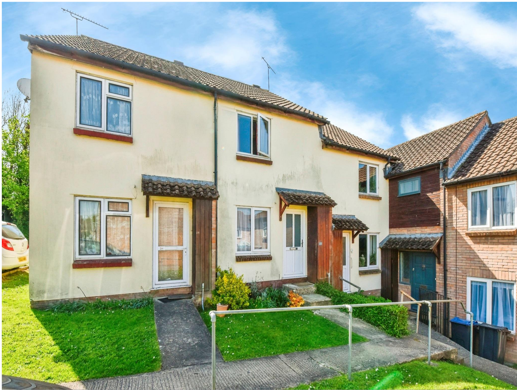
Pavely Close, Chippenham SN15 2BZ