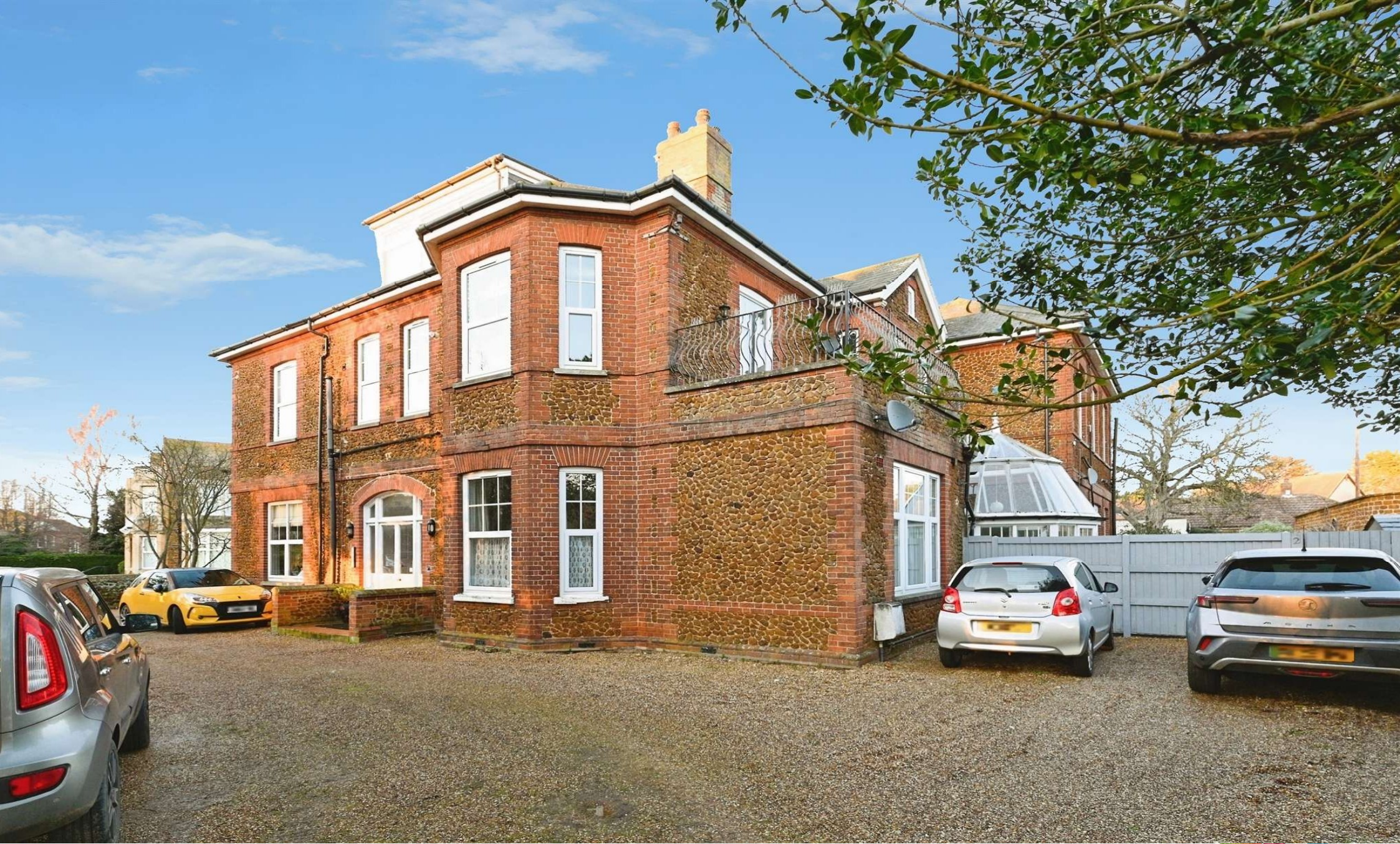
Flat 4 Homestead Apartments, Sandringham Road, Hunstanton, PE36 5DP