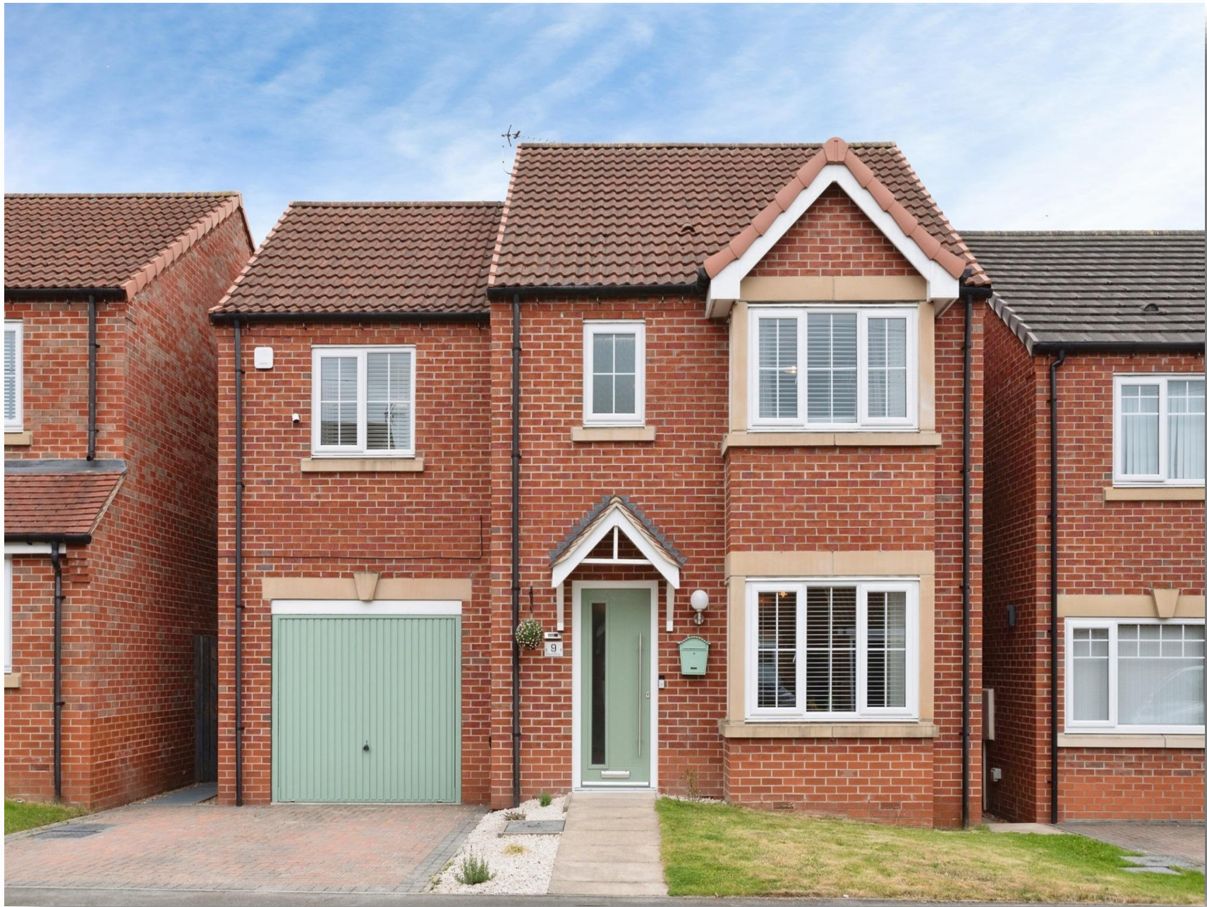
Oxland Drive, Hull, HU8 9EX