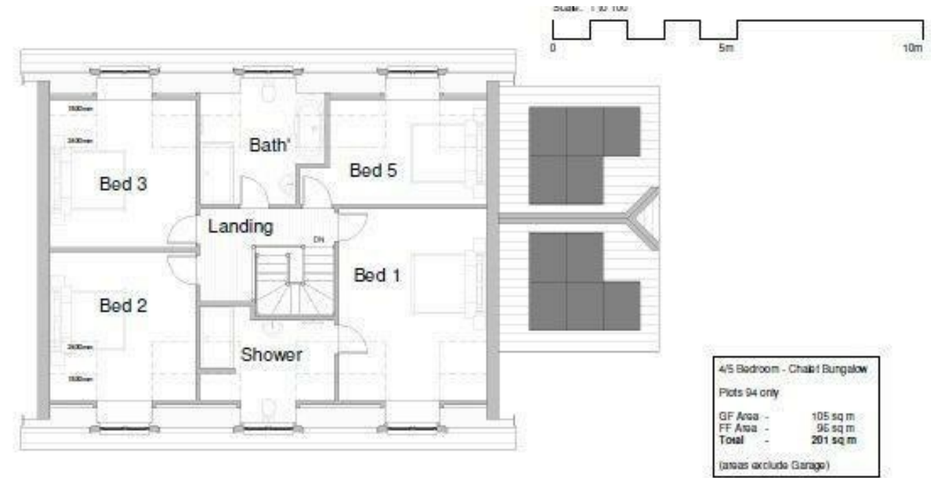
2 First Floor Plan 1 : 100

Call or WhatsApp: 01983 642622 office@elliottlincoln.co.uk www.elliottlincoln.co.uk