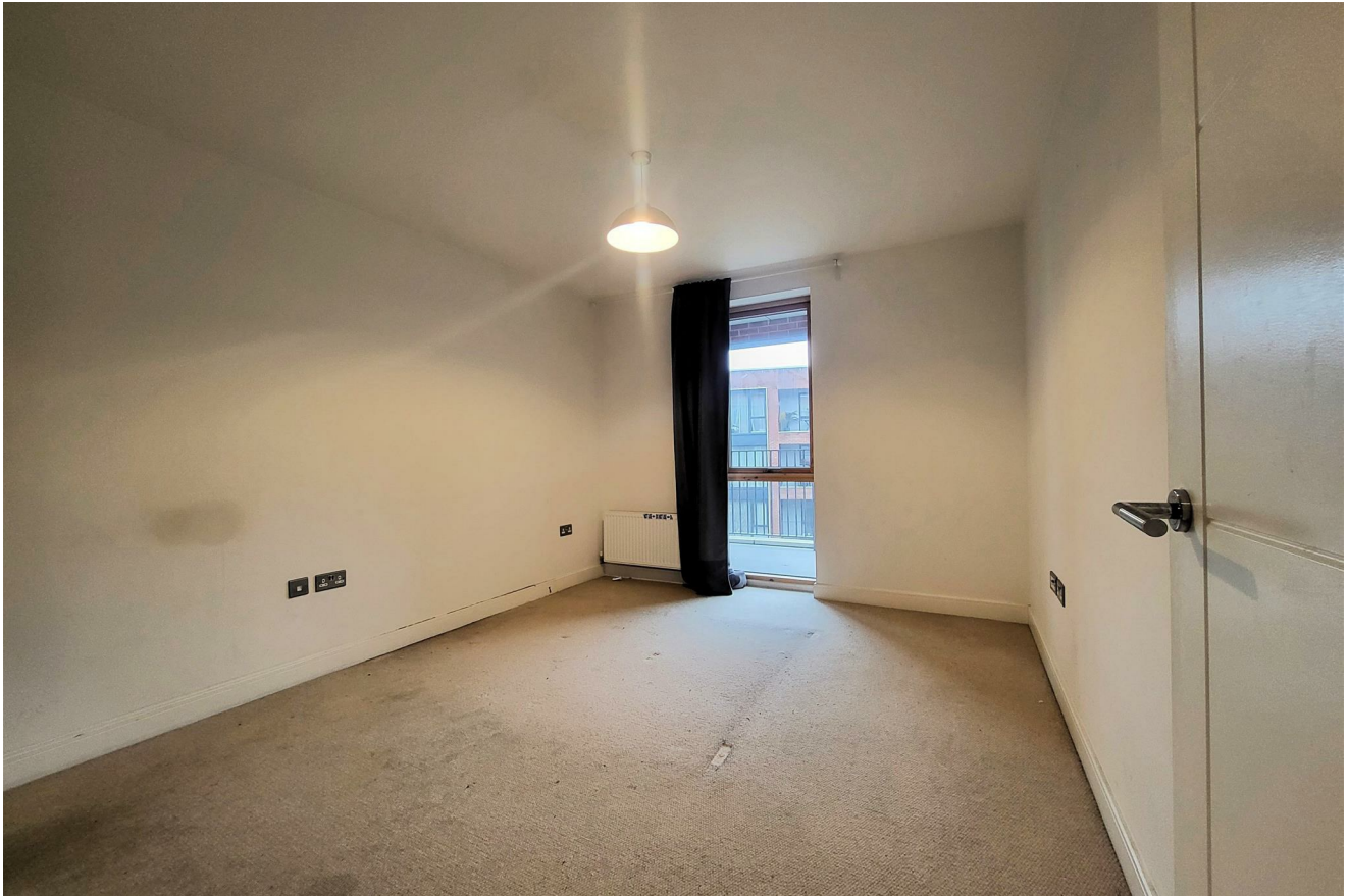
DOUBLE BEDROOM (pic 2) Different Aspect Showing the Fitted Wardrobes.

DOUBLE BEDROOM 12'8 x 10'9 upto wardrobes (3.86m x 3.28m upto wardrobes) Good Sized Bedroom with Fitted Wardrobes with Glazed Sliding Doors, Radiator, Double Glazed Window Overlooking Balcony & Side of Building & Communal Gardens.