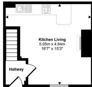
Ground Floor Approx 24 sq m / 254 sq ft