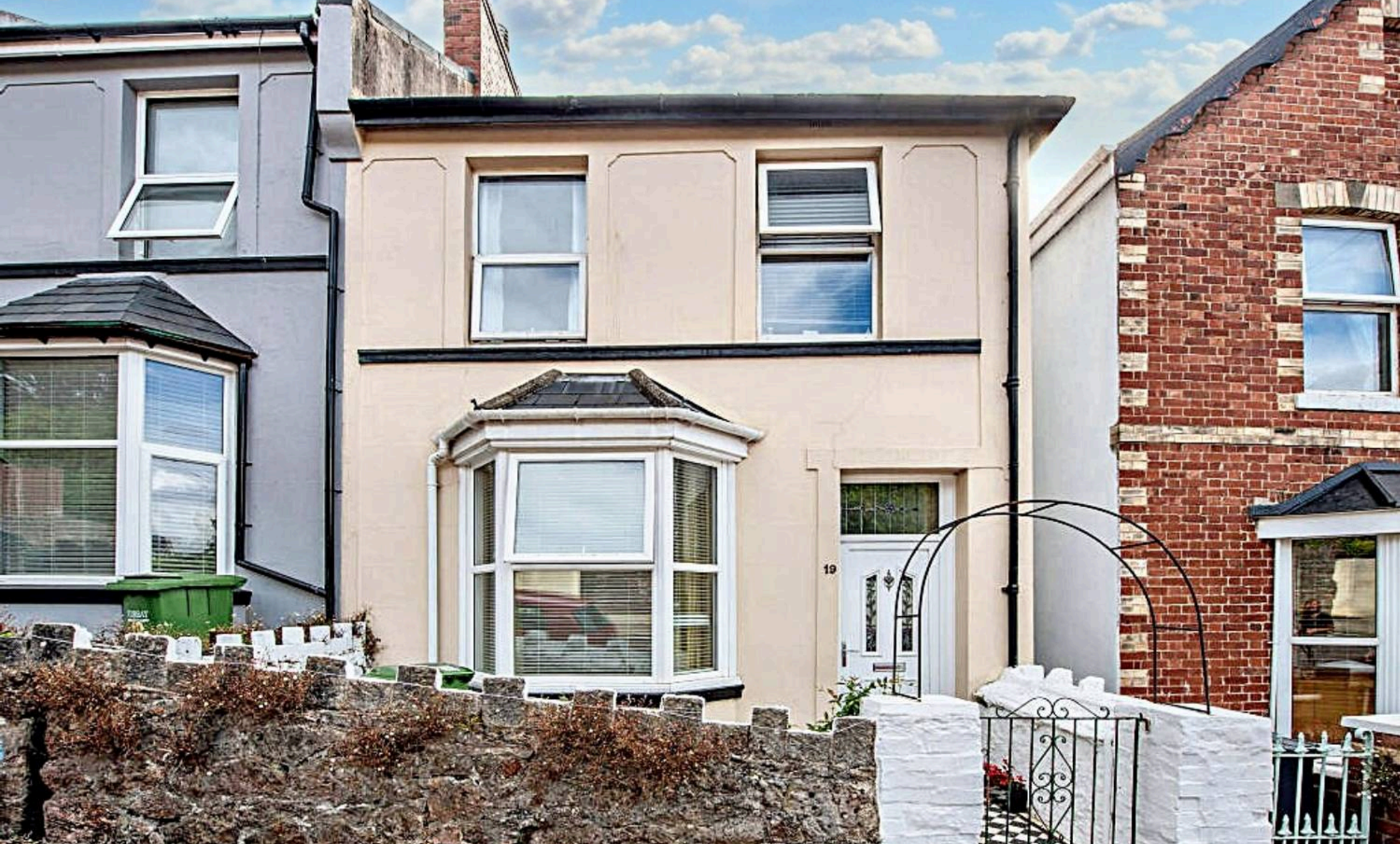
19 Lower Shirburn Road, Torquay – TQ1 3ET £220,000