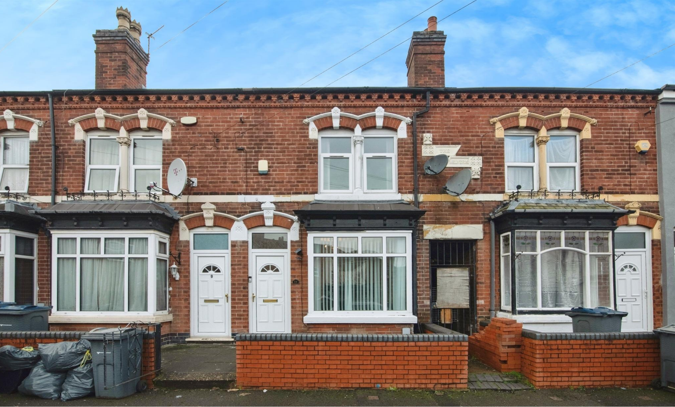
Howard Road, BIRMINGHAM B20 2AN