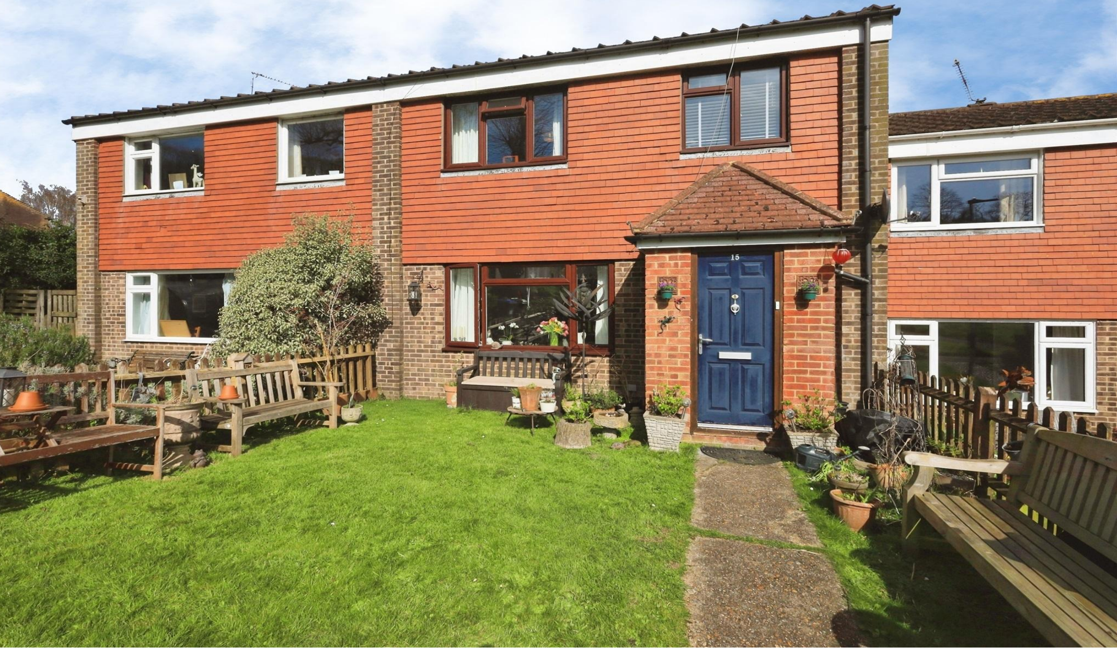
Hayward Road, Lewes BN7 2TW