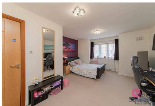
Long Lane N3 2HX Gross Internal Area 635 sq ft / 59 sq metres (Excluding Shed)