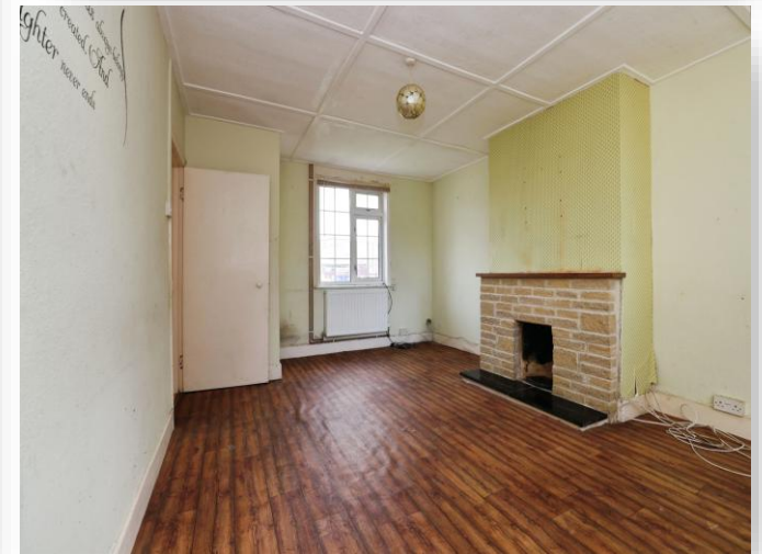
New Buildings, Nursted Road, Devizes SN10 3DZ