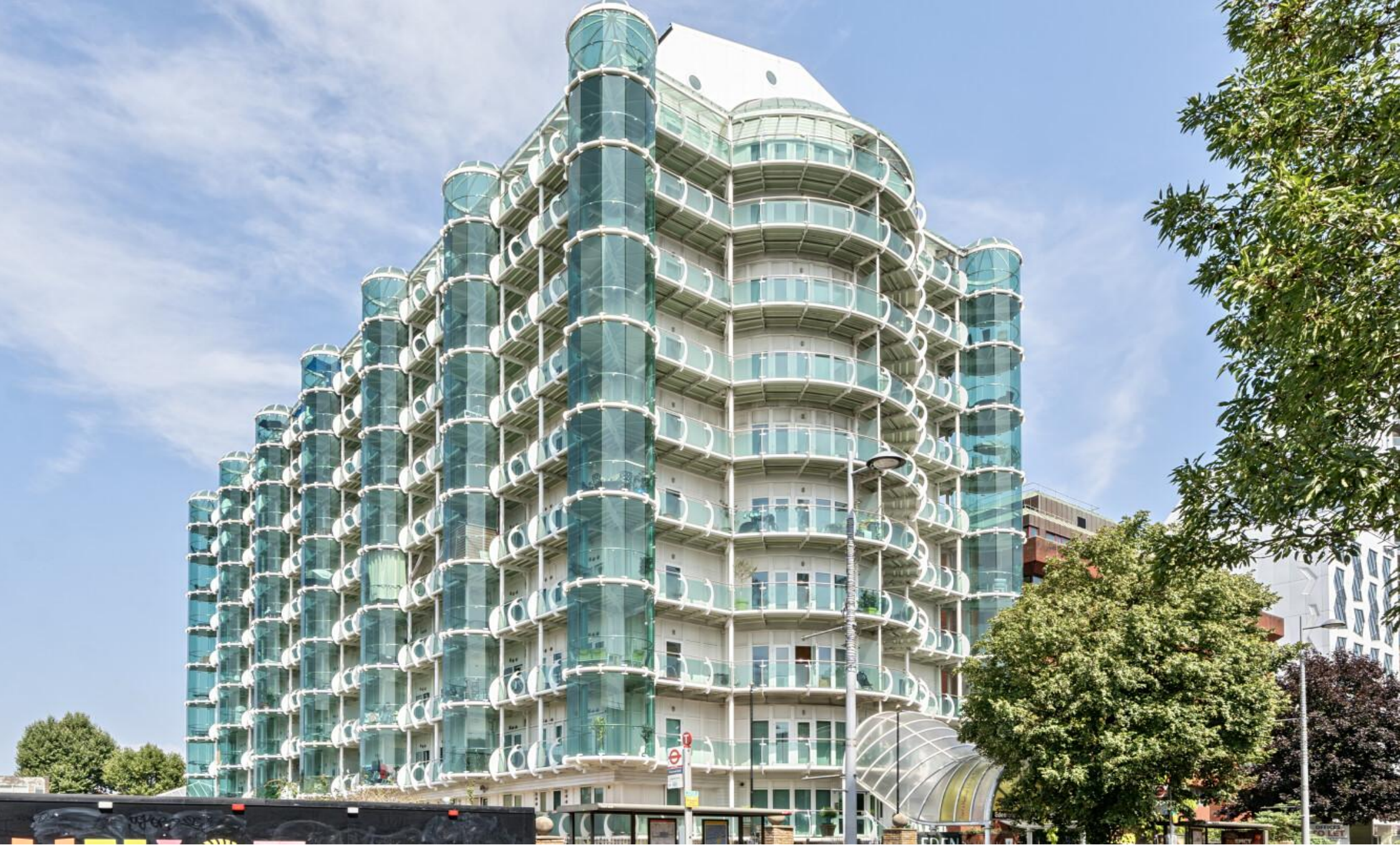
Cavalier House, Uxbridge Road, London, W5 2SS