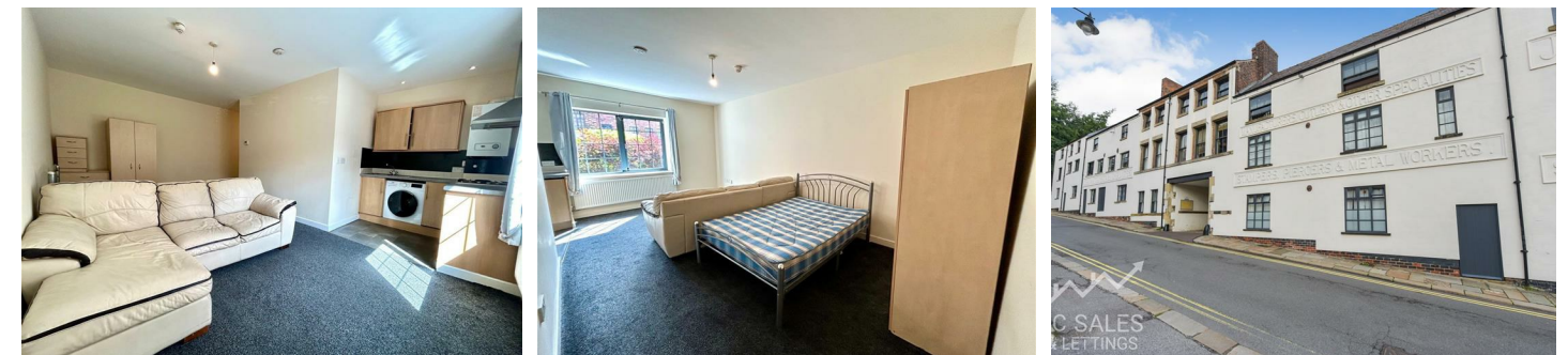
Apartment 18, 33, Cutlery Works Lambert Street, Sheffield, S3 7BG