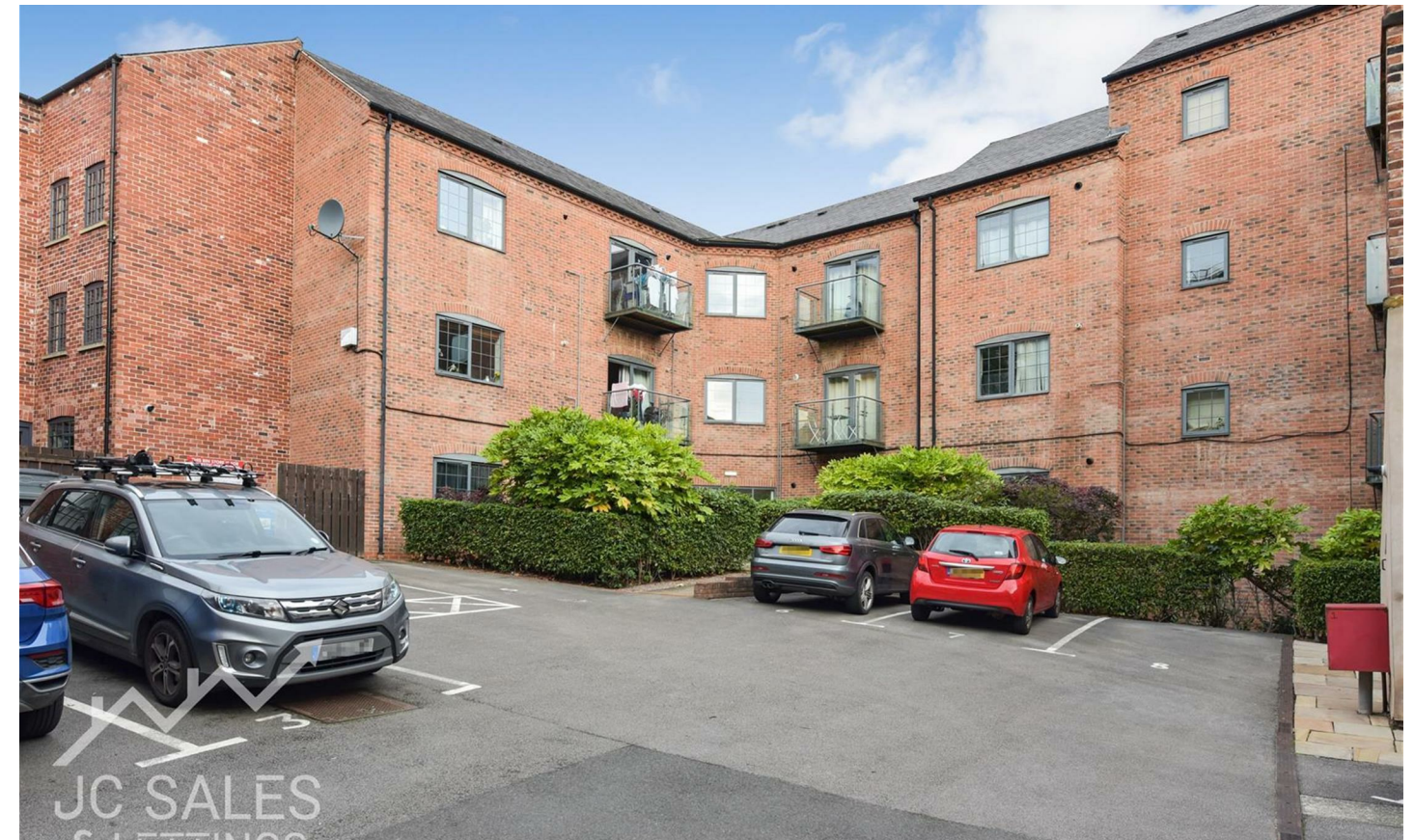
Apartment 18 Cutlery Works, 33 Lambert Street, Sheffield, S3