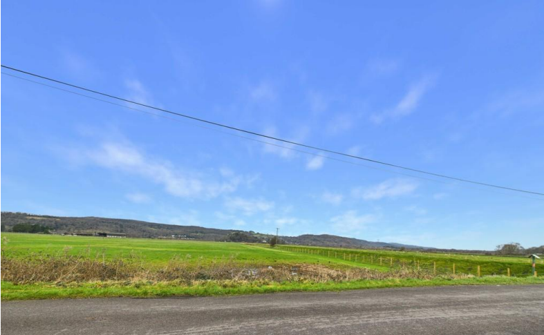
View from the front of the property