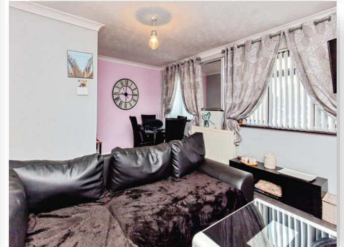
Alfred Street, Kettering NN16 0SW