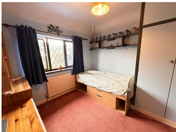
Bedroom Three 9'4" x 6'0" (2.85 x 1.85)

uPVC double glazed window overlooking garden.