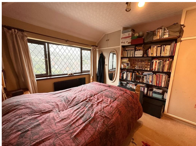
Bedroom One 12'3" x 9'7" max (3.74 x 2.93 max)

uPVC double glazed window overlooking garden, radiator, built in wardrobes.