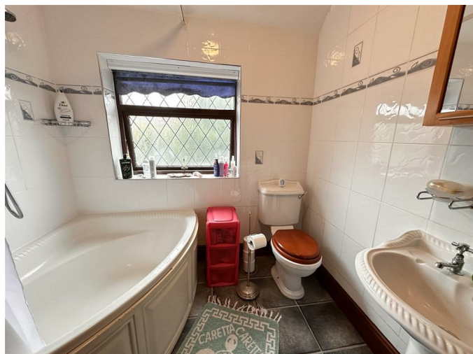
Family Bathroom 8'7" x 8'7" (2.63 x 2.63)

Suite comprising corner bath with mixer shower over, low level wc, pedestal wash hand basin, tiled walls, uPVC double glazed frosted window to front, heated towel rail. Built in airing cupboard.