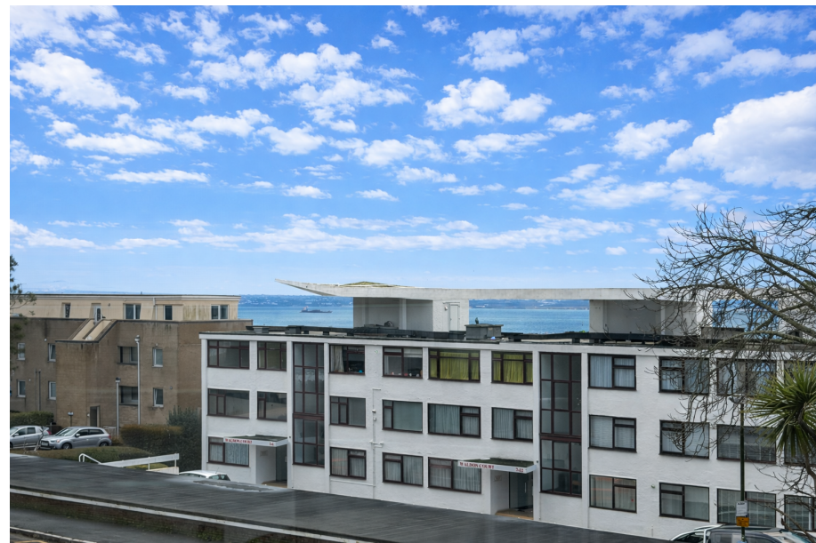
34 Waldon Point

A light and airy studio apartment is set within the desirable Waldon Point development, a stones throw from Torquay's seafront. In need of some renovations and upgrading throughout, the apartment offers a spacious main living/studio area with large windows enjoying views towards the Sea, ideal for enjoying the coastal atmosphere. There is a separate kitchen, and a white suite bathroom, providing functional and private spaces within the home. Outside there are well maintained gardens, allocated Parking and ample street parking. No ownwards chain.