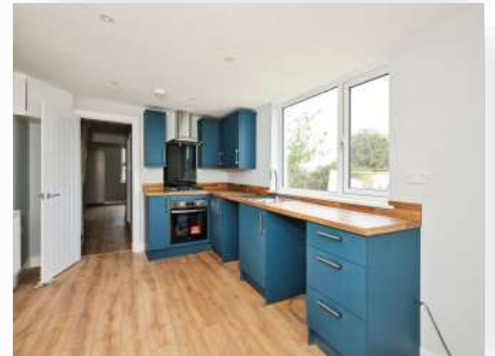
Cross Street, Farcet Peterborough PE7 3DD