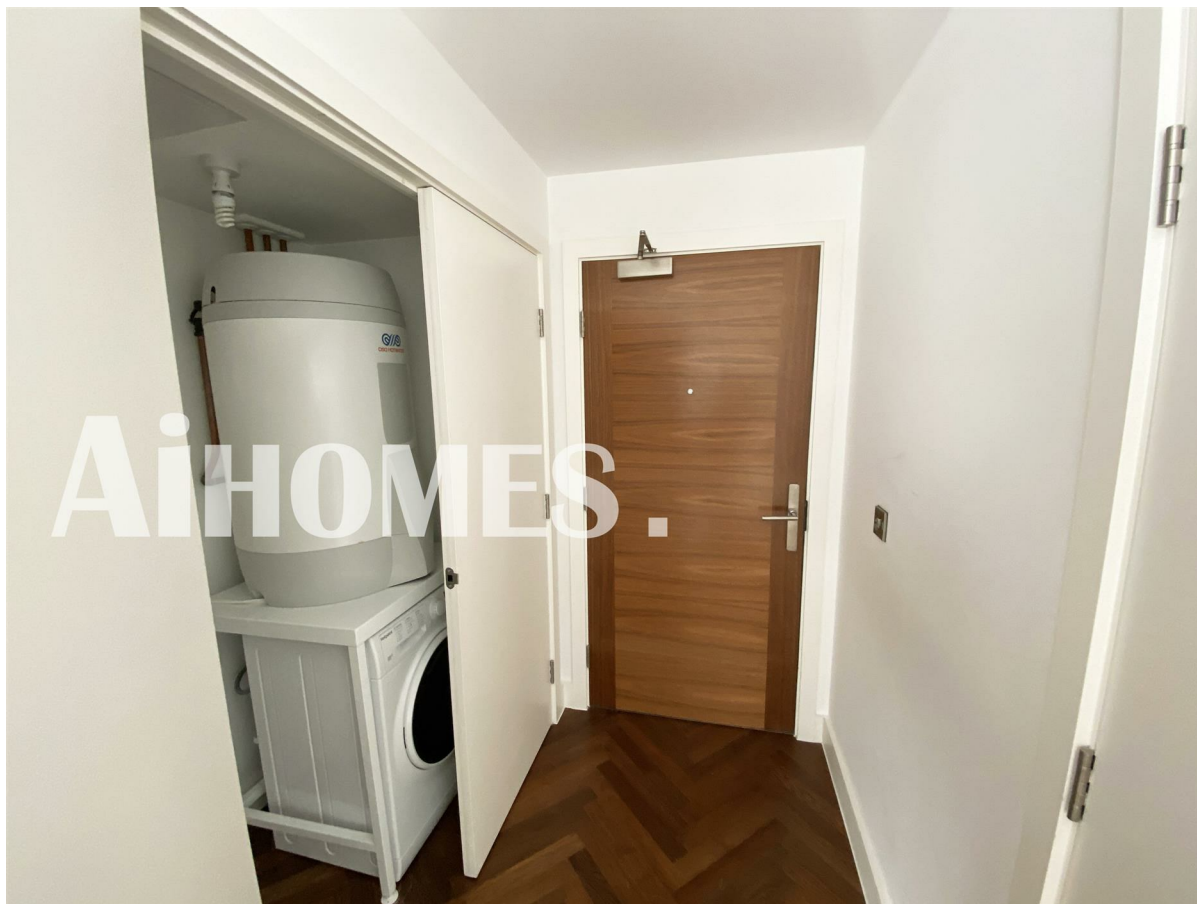
Luxury 2B2B Apartment | Deansgate Square | M151A1023095DS