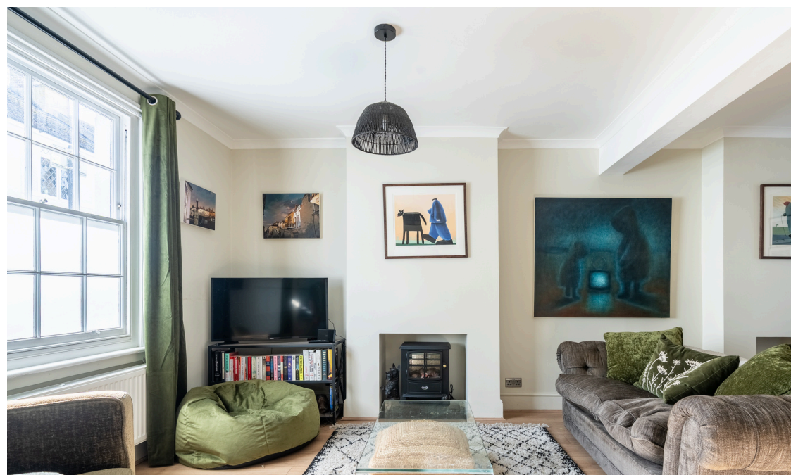
Queens Gardens, Brighton, BN1 4AR Asking Price £550,000