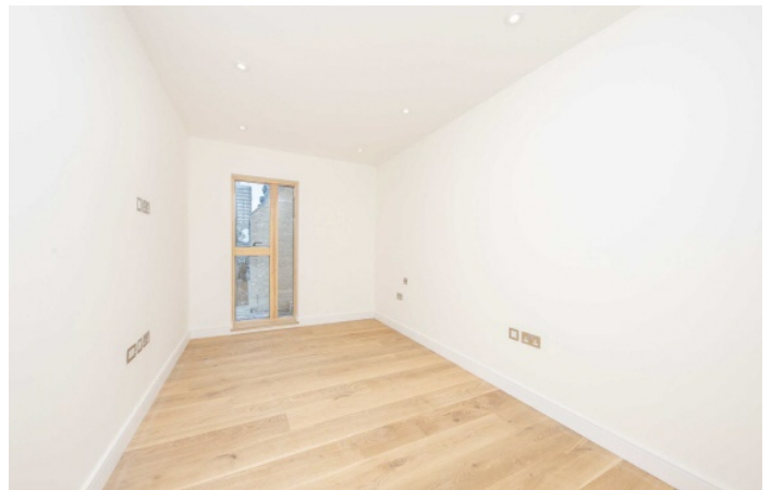
Hampden Road, KT1