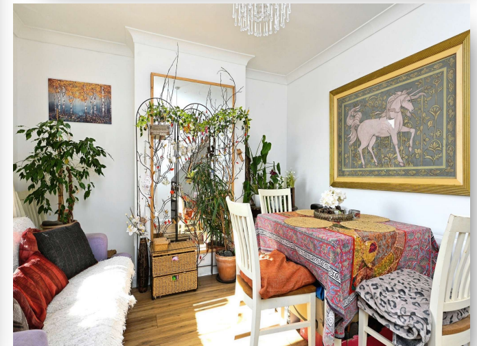
White Horse Drive, Dersingham, PE31 6HL