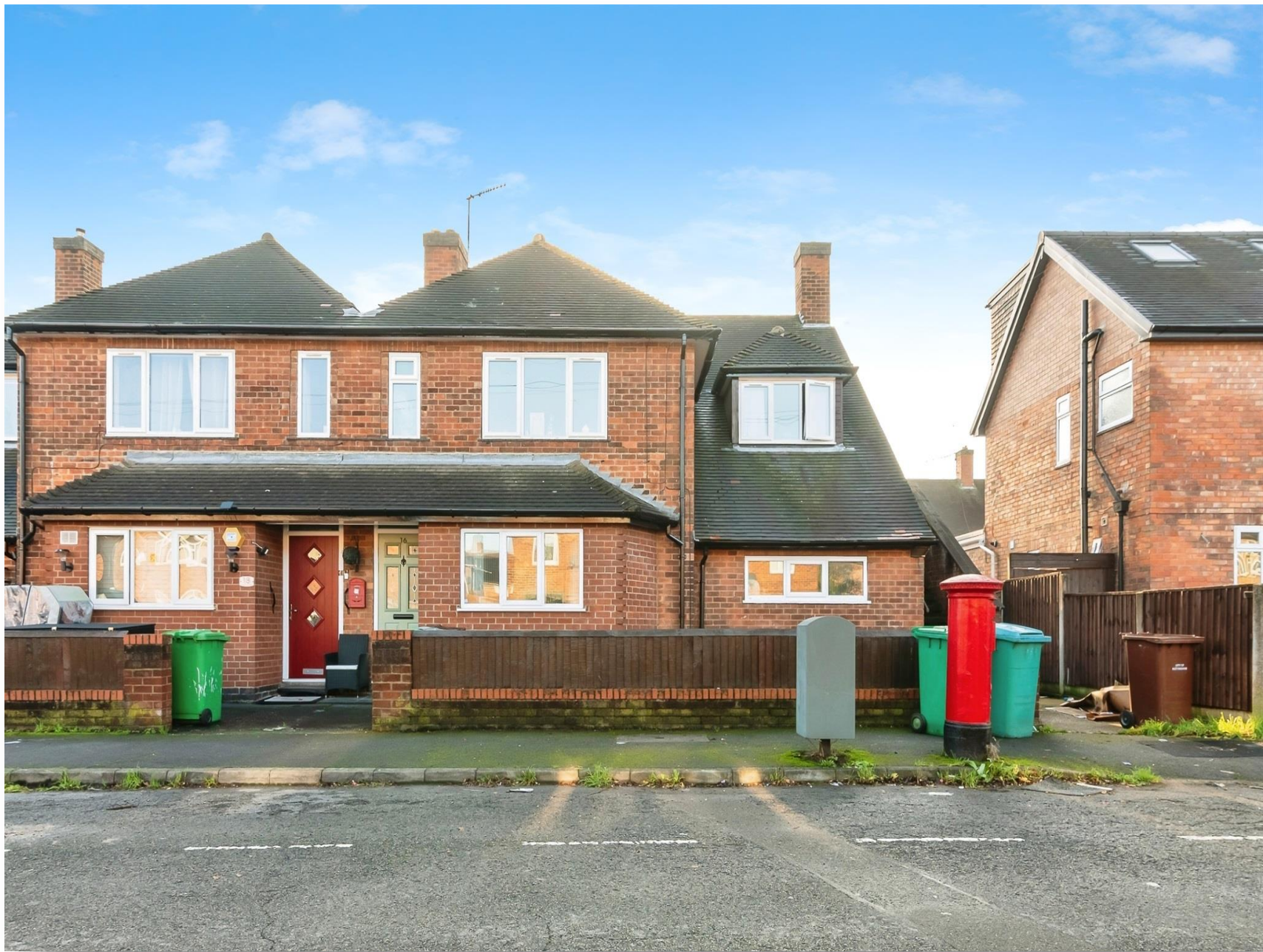
Ainsley Road, Nottingham NG8 3PP