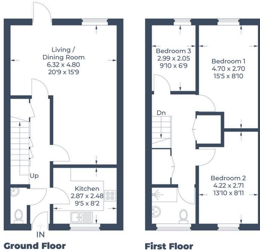
Illustration for identification purposes only, measurements are approximate, not to scale. © CJ Property Marketing

Approximate Gross Internal Area Ground Floor = 44.1 sq m / 475 sq ft First Floor = 43.9 sq m / 472 sq ft Total = 88.0 sq m / 947 sq ft