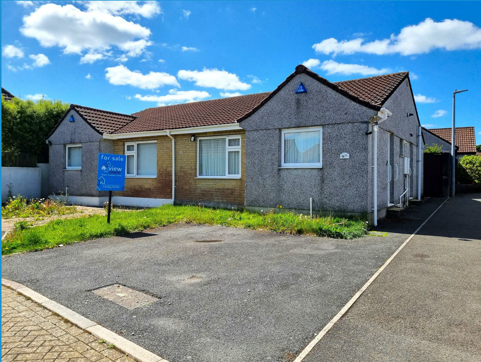
Moorland View Liskeard | Cornwall