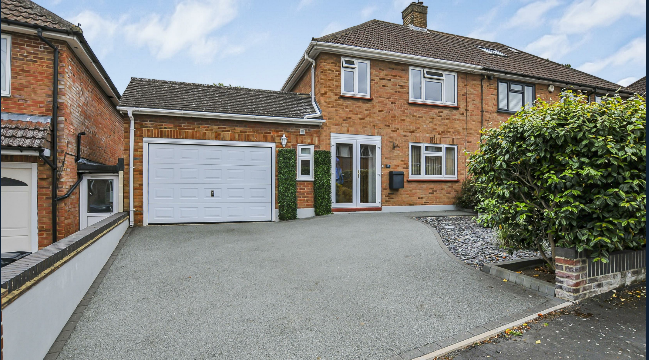
19 Reynards Way, Bricket Wood, St. Albans, AL2 3SG Guide Price £630,000