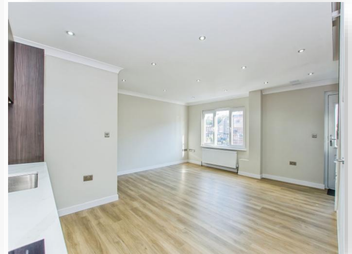
Bruce Court, Chapel Road Wisbech PE13 1RW