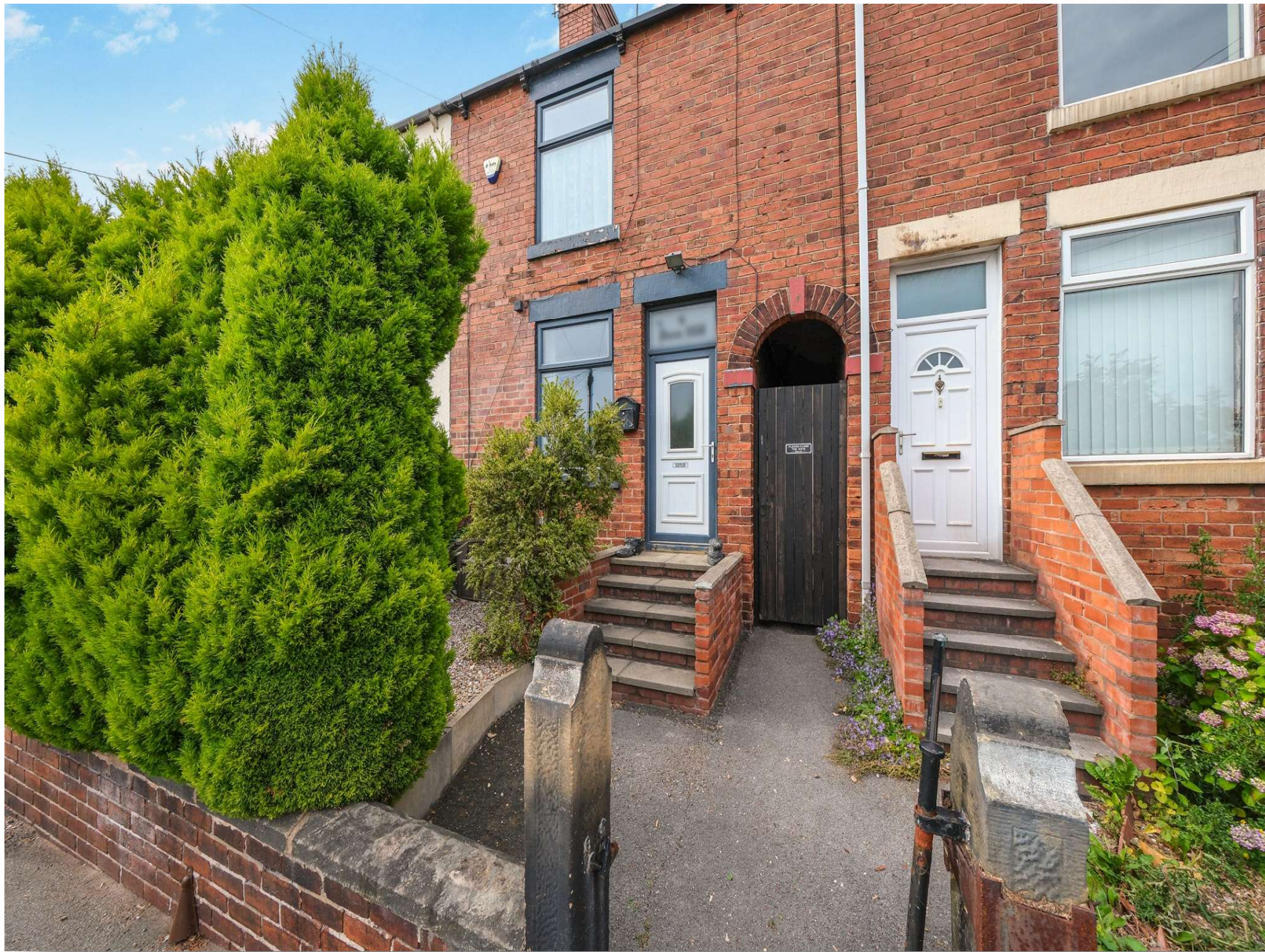
Rose Hill, Chesterfield S40 1LW