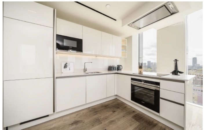
Union Street, SE1