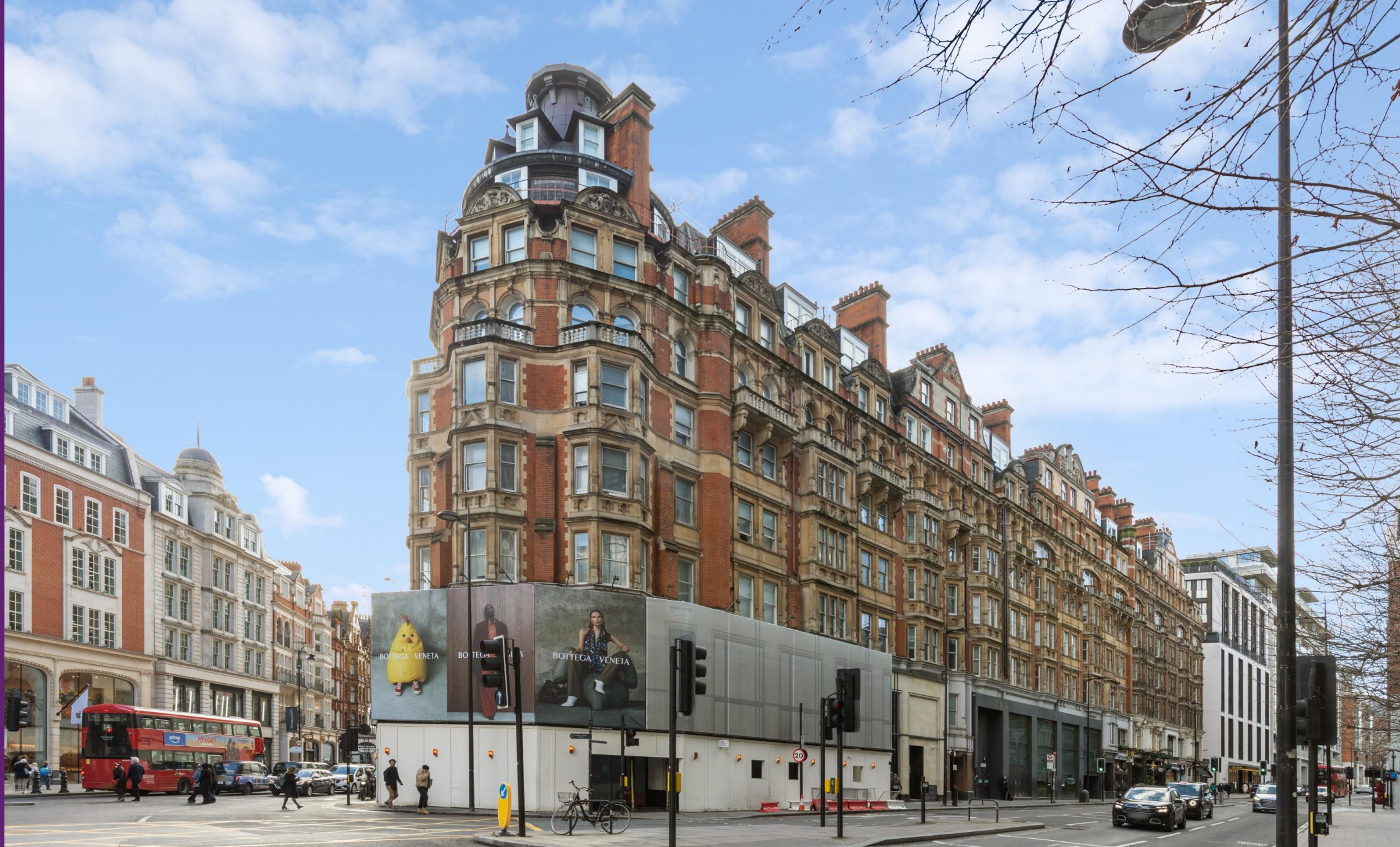
Park Mansions Knightsbridge, SW1X