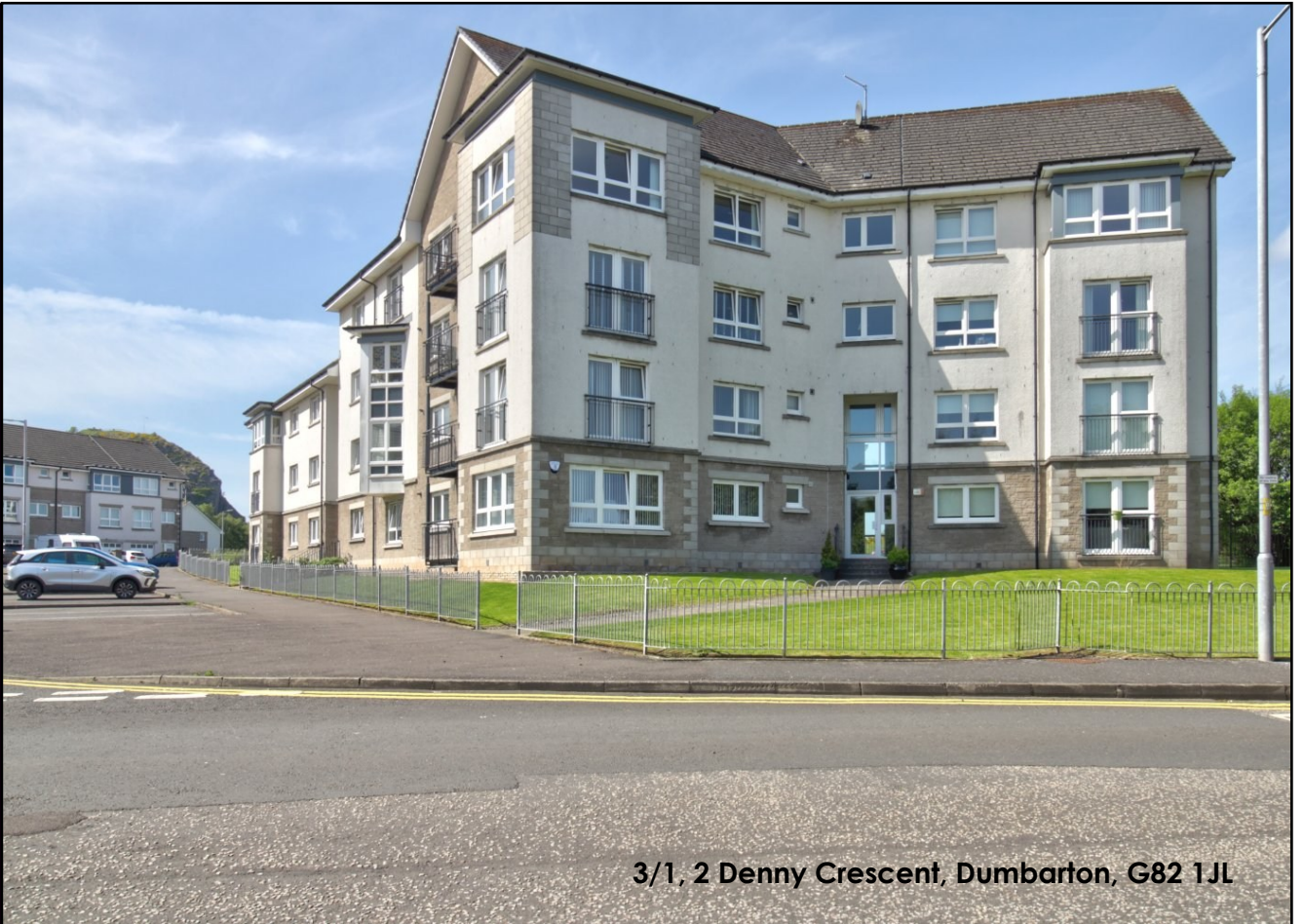
3/1, 2 Denny Crescent, Dumbarton, G82 1JL

Beautifully presented and filled with natural light, this stylish two-bedroom top-floor apartment offers an exceptional standard of modern living within the sought-after Castle Quay development. Originally the Turnberry show flat, it enjoys upgraded finishes, generous room sizes and impressive open views that create a wonderful sense of space.