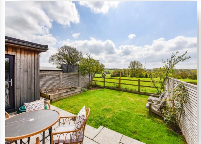
The Leazes, Woolverton, Bath BA2 7QR