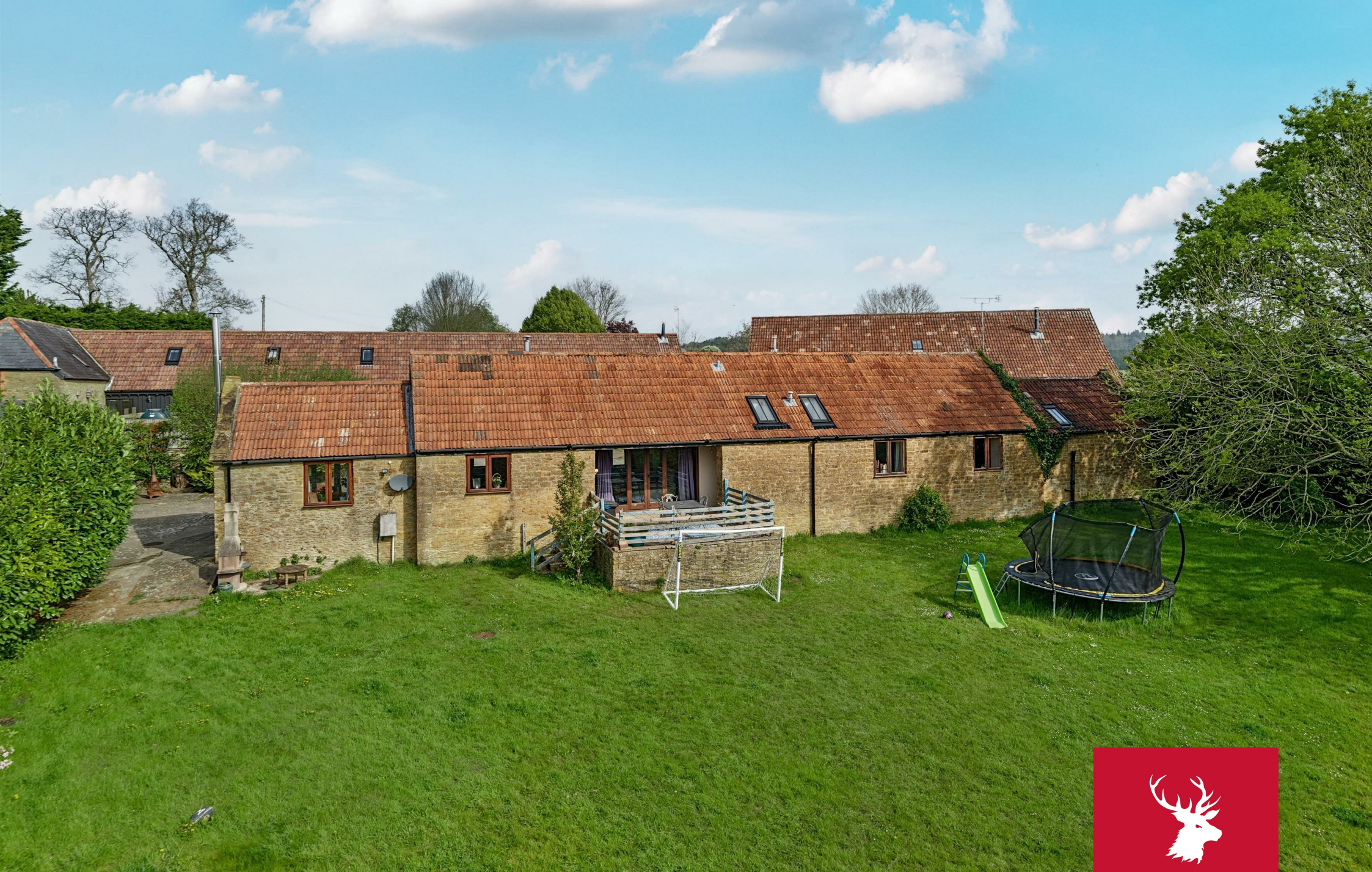
The Old Barn